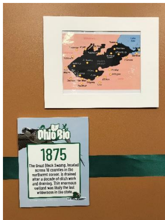
Example of dates on the timeline and accompanying graphics

Visitors walk through the exhibit reading the timeline of significant events in Ohio's past. Each sign displays dates and facts about native species, along with relevant photos, graphs and maps. Signs are posted in chronological order beginning in 1787 with the formation of Ohio, and ends with the present day.