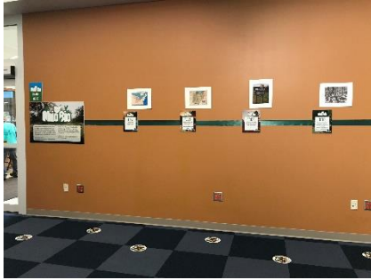
Bear paw prints on the floor help guide visitors through the exhibit

Intermittently, signs have a special window on them with a red lens. They are prompted to slide their species card into the window to read about their species' population at that time period.