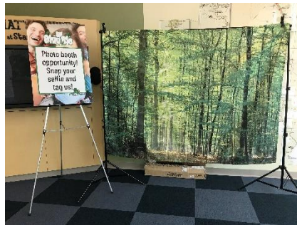
Photo booth with props